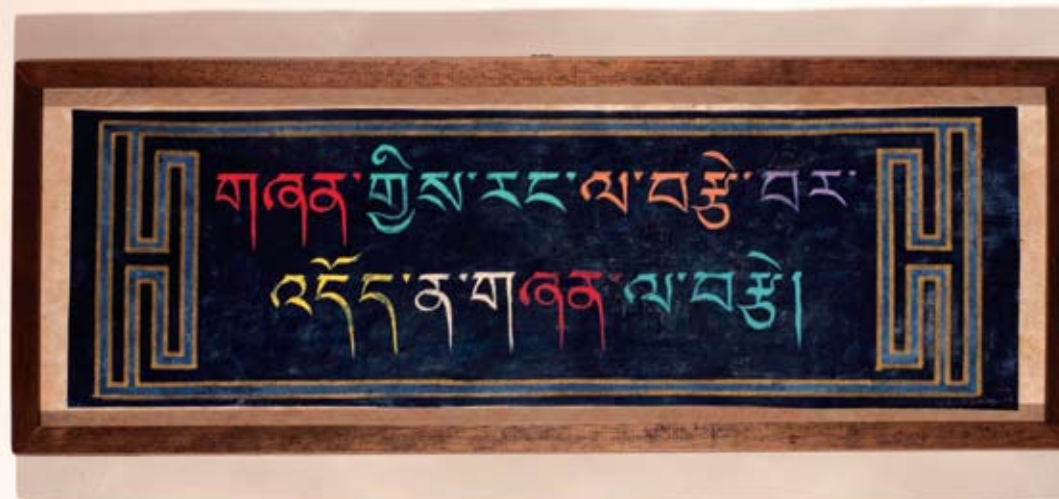
Tibetan. Ink on paper