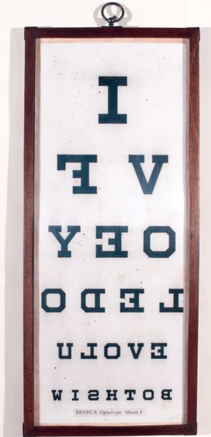
English. Ink on card