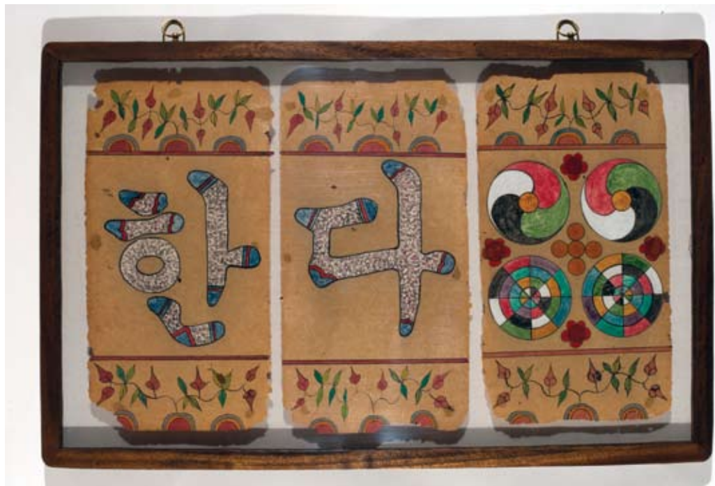
Korean - Gouache and ink on antique paper