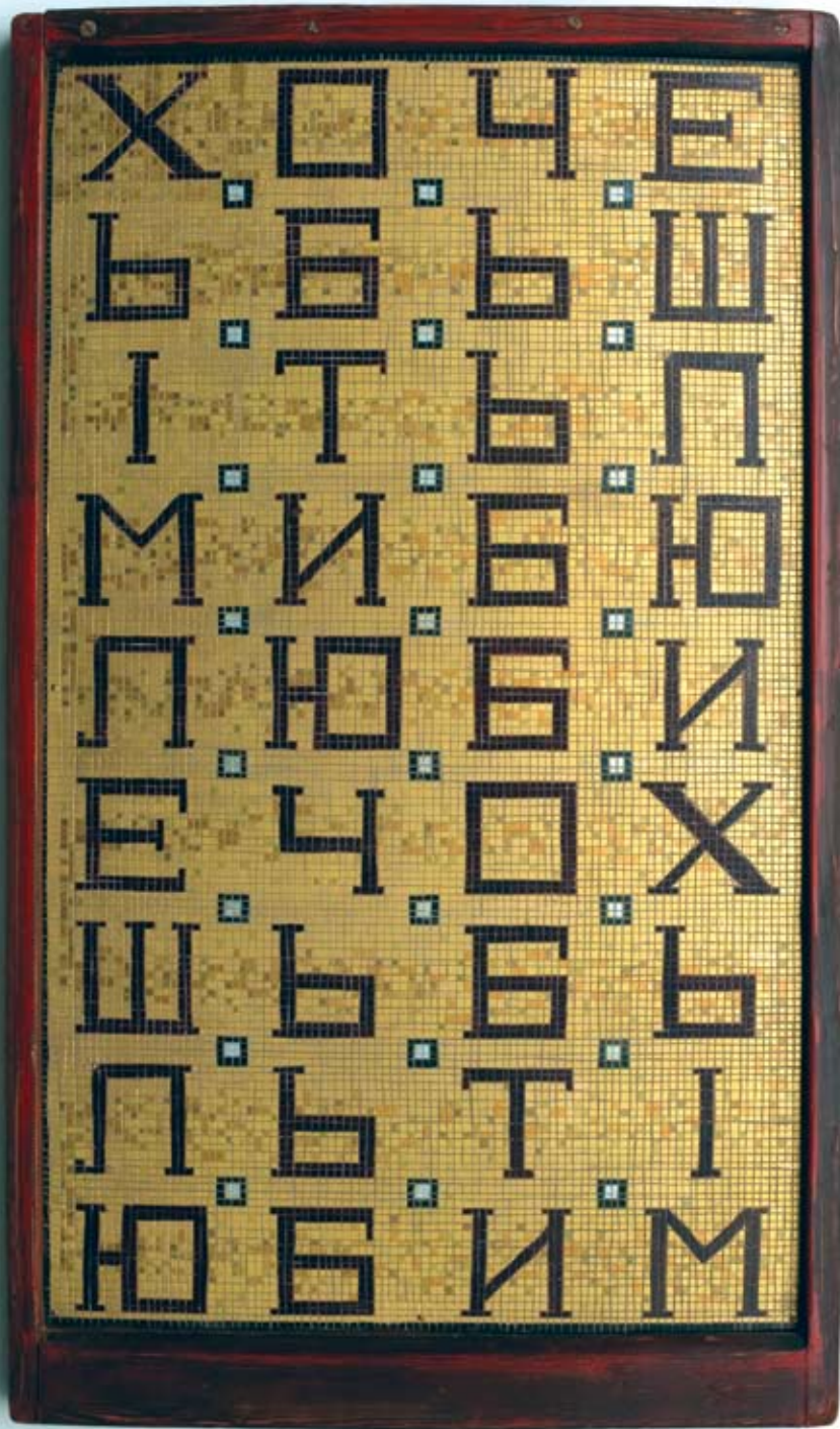
Russian. Enamel paint and gold on inscribed Medium Density Fibre and pine