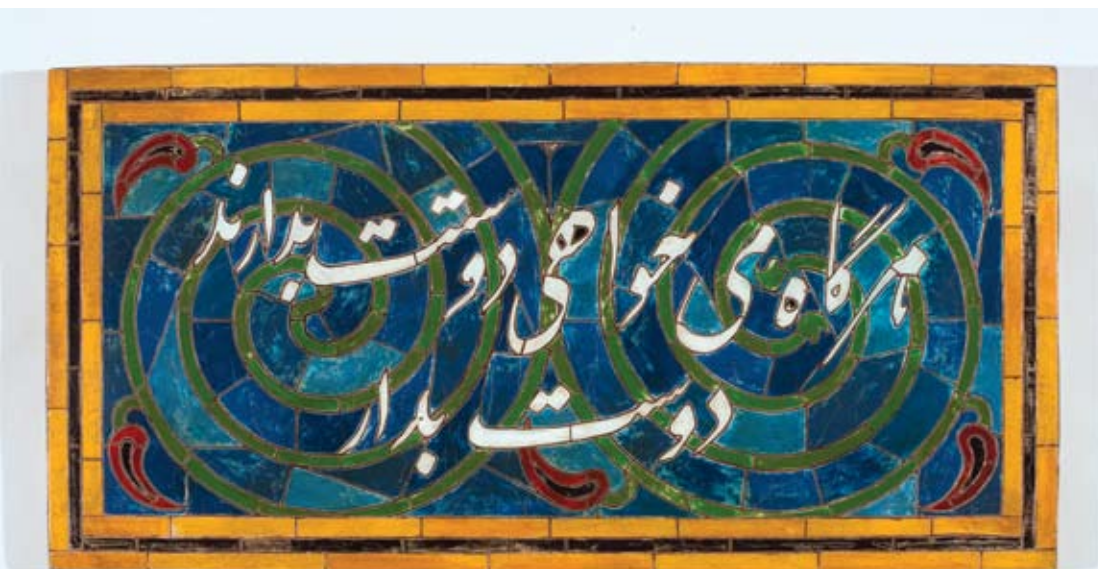
Farsi. Enamel paint on inscribed Density Fibre Board